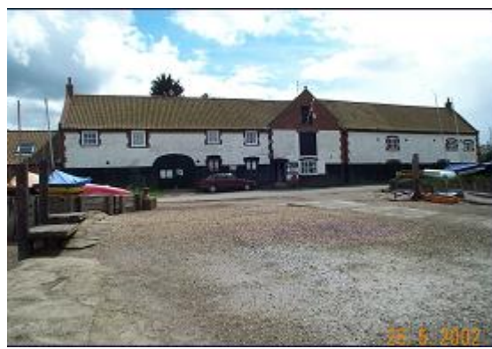
Photos: Burnham Overy Staithe, copyright Tim Lidstone-Scott/National Trail

The 'staithe' (or harbour) is a most atmospheric little place with black-tarred cottages overlooking masts in a creek backed by saltmarsh. A drainage dyke zigzags its way above tall reeds, giving fine views of the marsh and farmland drained in the 18th century by Thomas Coke, the great agricultural 'improver' of Holkham Hall. Beyond the dunes the route continues along a huge beach that extends a mile or so out at high tide. At Holkham Gap, one of Europe's prime areas for spotting wild geese, a pine forest flanks the beach, and you can take the boardwalk through the dunes to reach the car park and A149 at the Victoria Hotel, Holkham. Before catching the bus from here you might like to wander into Holkham Park and visit the pottery and Holkham Hall (see below).